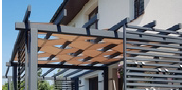
Figure 1. Gazebo/Roman strips of Premium Decor fabric