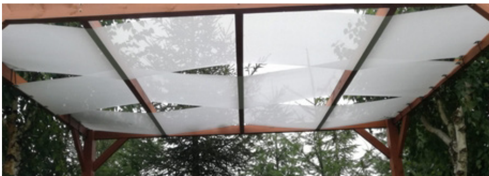
Figure 2. Proposed way of strip installation.